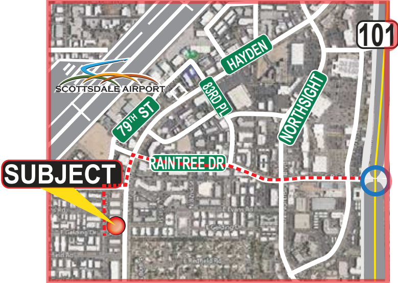
CLOSE PROXIMITY TO RAIN TREE/LOOP 101 INTER-